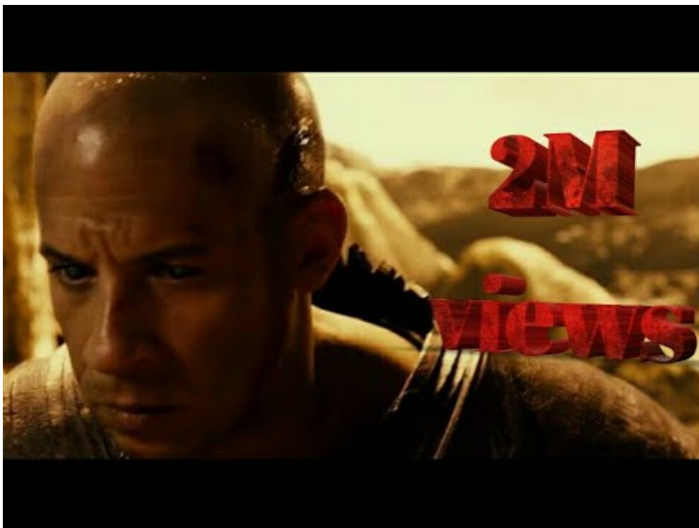
Manjhi The Mountain Man